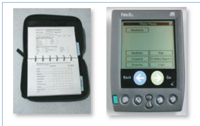
Figure 1. The instrumented paper diary (left) and the electronic diary (right). (Not to scale.)

All subjects were asked to complete a pain assessment on three occasions each day (10 A.M., 4 P.M., and 8 P.M.). Two types of compliance were analyzed: reported compliance (based on the time and date written on completed diary cards) and actual compliance (based on the time and date record that was automatically recorded by the devices). The EDs allowed entries to be made only during a window of ±15 minutes around the scheduled assessment times, and incorporated features to enhance compliance, such as an audible alarm at the time of assessment